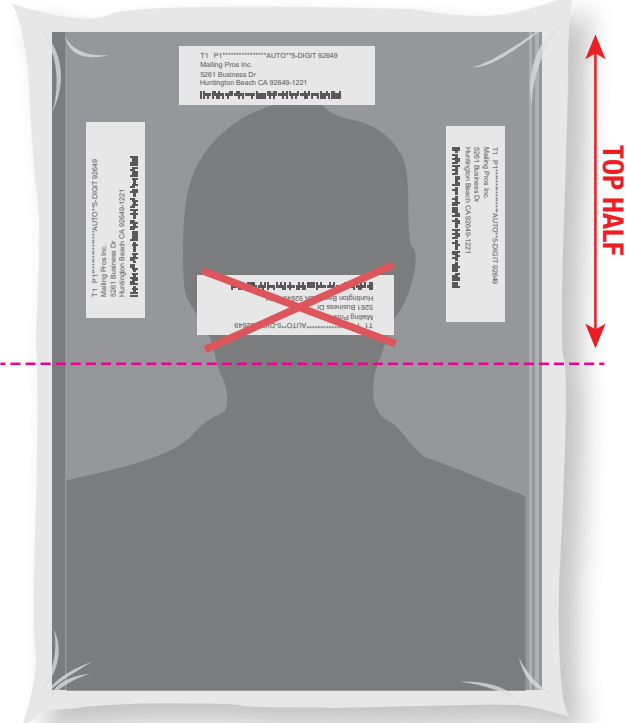
#1: Address affixed to mailpiece inside polywrap