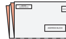
FOLD AGAIN PERPENDICULAR TO THE FIRST FOLD

Paper weight ≤ 1 oz : minimum 70lb text or equivalent