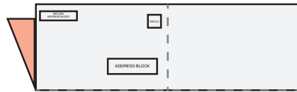
FOLD IN HALF LENGTHWISE FIRST